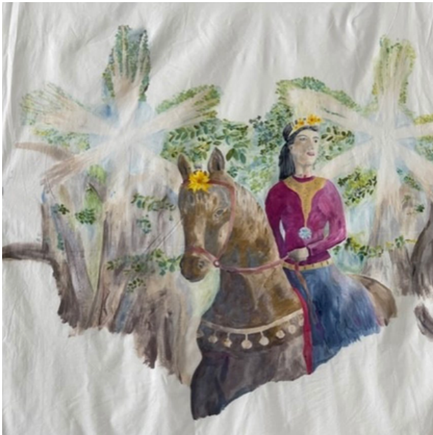
"Warrior of Beauty and Illumination"

In the end, she will be about 4' x 5'. Unlike ALL the other quilts I have made which rarely take longer than 2-3 weeks, this one will be at least five months in the making. Luckily, I have a great art practice ritual, fantastic support and the best teachers